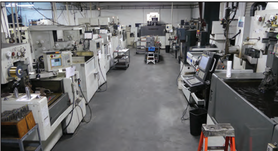
One of Reliable's Wire EDM Departments