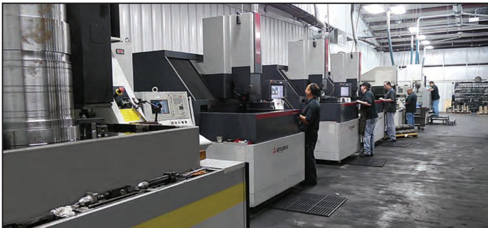
Part of Reliable's Ram/Sinker EDM Departments