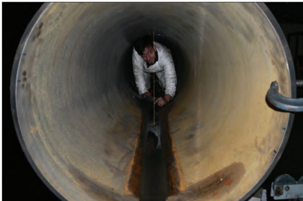
Modified Wire EDM Machine Split Large Tube Diameter 27 Inches, Length 16.5 Feet.