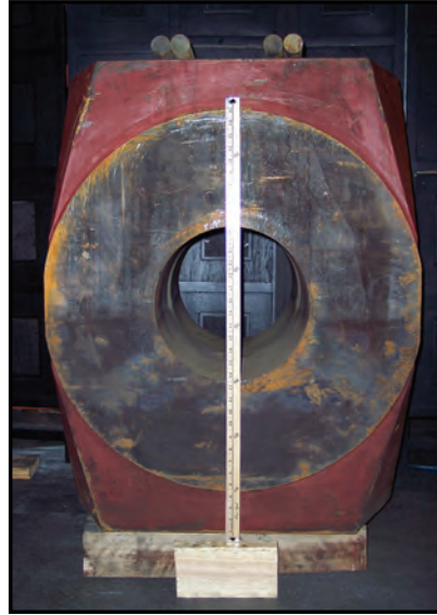
Test Specimens for Blowout Preventer: 40 inches (1016mm)

Reliable EDM does various kinds of work for aerospace, defense, petroleum, plastics, electronics, medical, and many other industries.