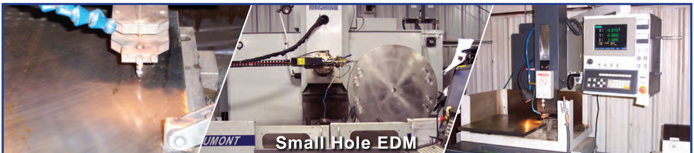
Small Hole EDM

Reliable EDM: Specialists in Wire, Ram, and Small Hole EDM